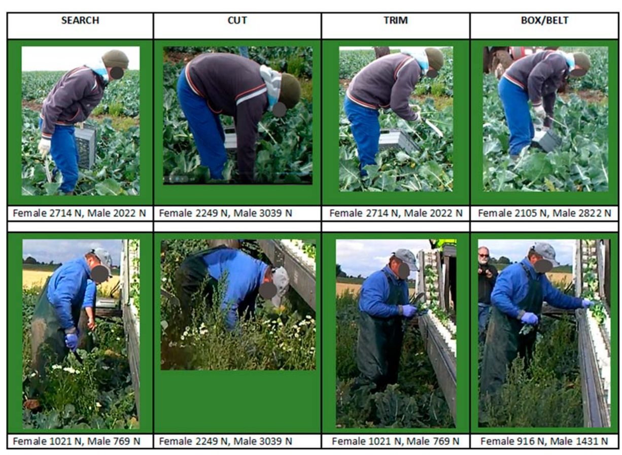
Figure 2. Working positions during harvesting of broccoli/cauliflower using a box (above) and using a conveyor (below). Calculated lumbar compression (N) for males and females in different work positions is given under the images

Stefan Pinzke, Lillian Lavesson. Ergonomic conditions in manual harvesting in Swedish outdoor cultivation