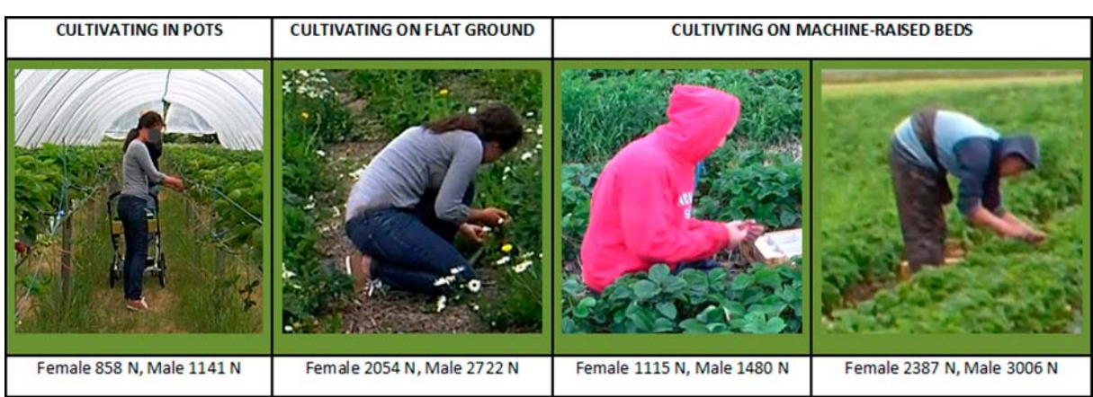
Figure 4. Working positions when harvesting strawberries cultivated in pots, on flat ground, and on machine-raised beds; 2 different work positions shown. Calculated lumbar compression (N) for men and women in different work positions is given under the images

<u>Most workers are at risk of MSD</u> during frequent work when standing bending forward with straight legs, or when sitting or squatting with one knee on the ground.