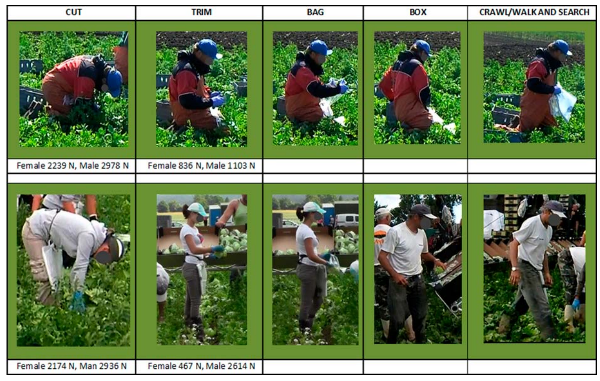
Figure 3. Working positions during harvesting of iceberg lettuce using a box on the plant bed (above) and using a box on a tilted arm (below). Calculated lumbar compression (N) for men and women in different work positions is given under the images